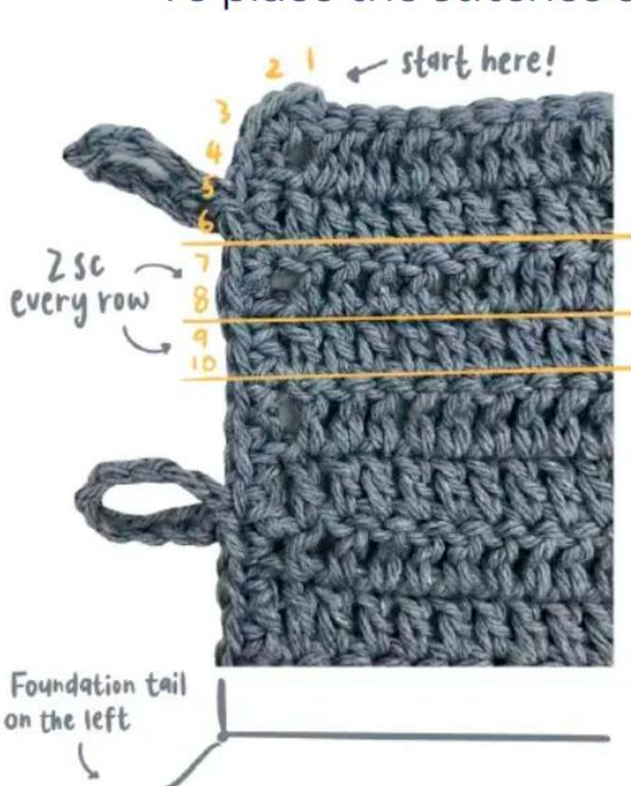
2nd stitch at the top left corner