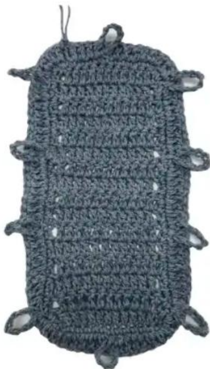
Pic of row 2