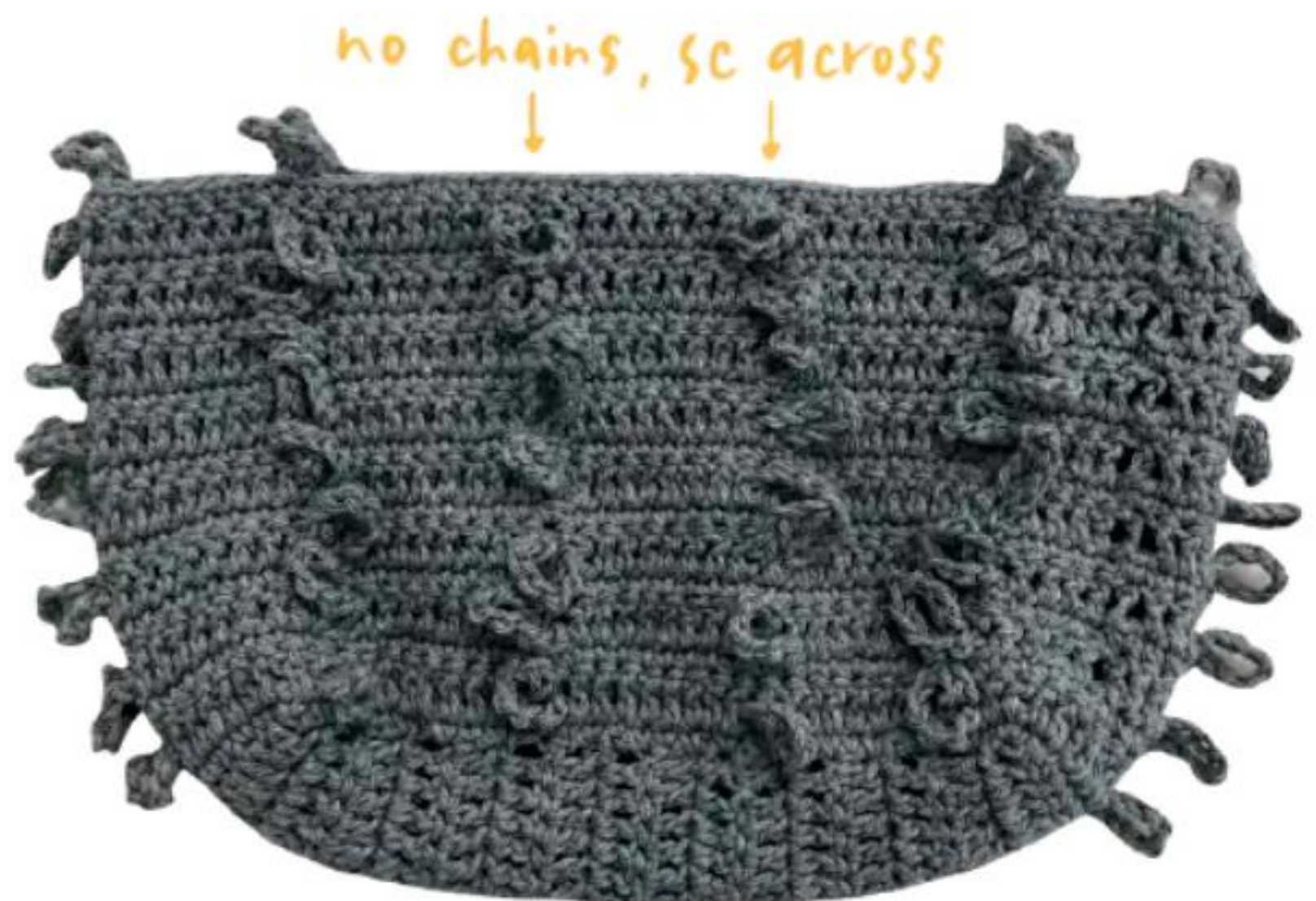
Pic of row 17