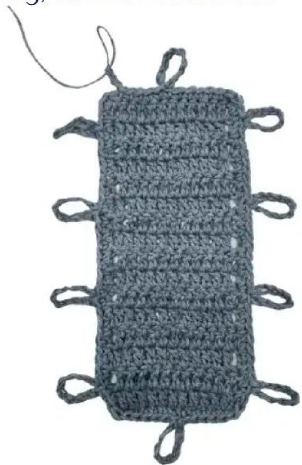
Pic of row 1