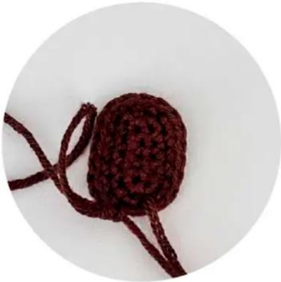
Example of gluing an insole